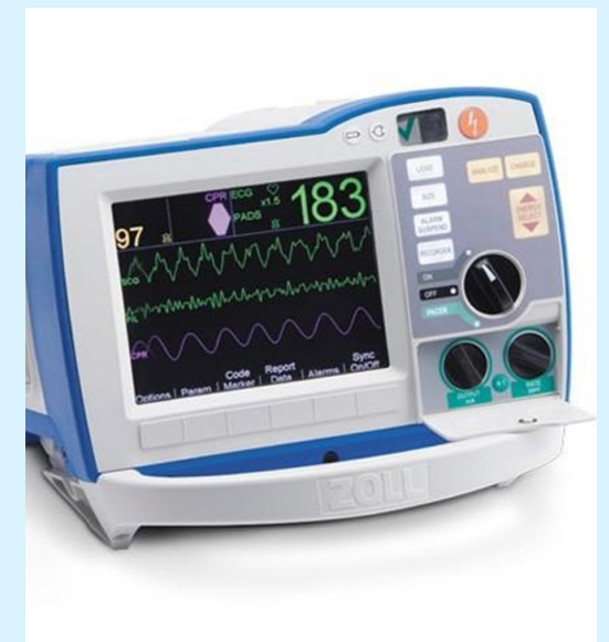
Code Cart & Defibrillator / AED